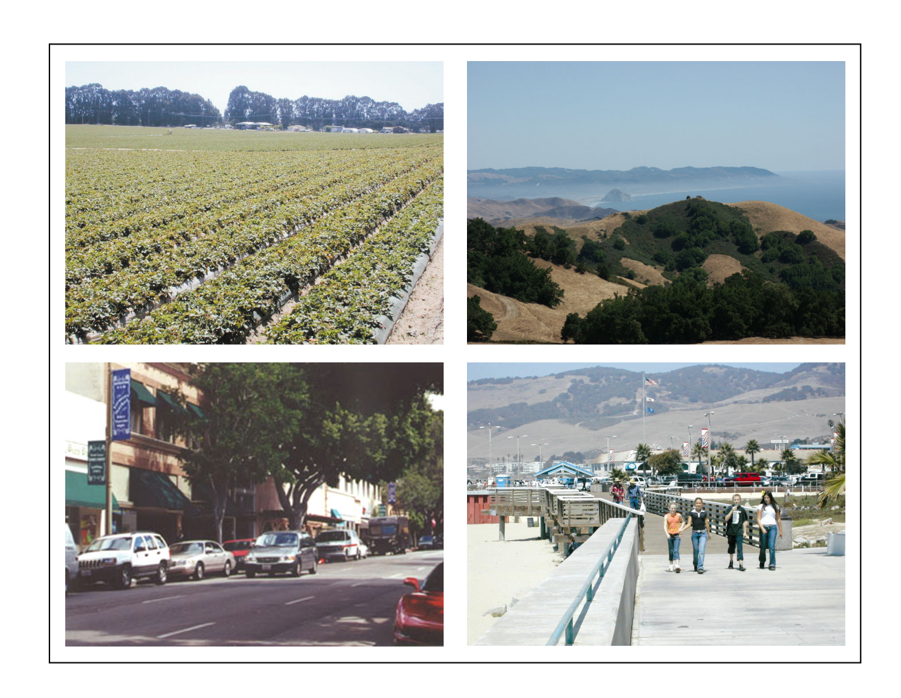
San Luis Obispo County