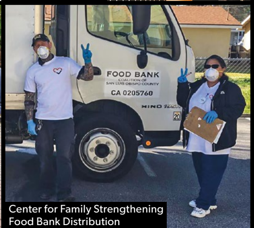
Center for Family Strengthening Food Bank Distribution