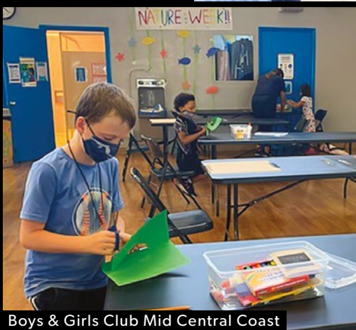
Boys & Girls Club Mid Central Coast