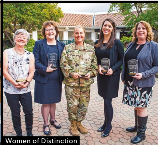
Women of Distinction