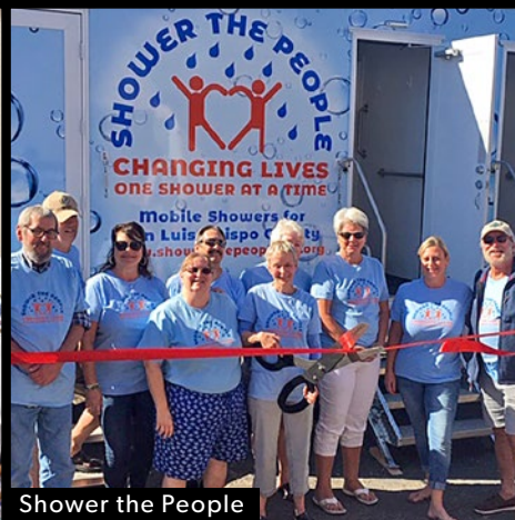
Shower the People