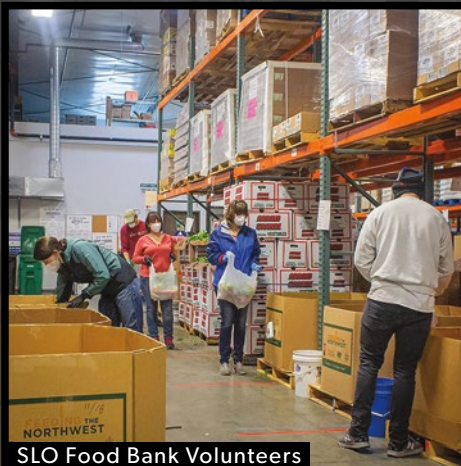
SLO Food Bank Volunteers

Confirmed in Compliance with National Standards for U.S. Community Foundations