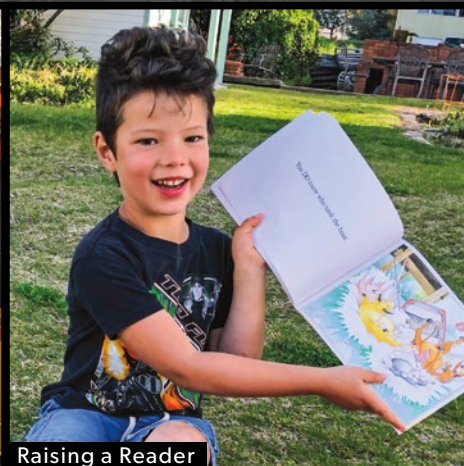
Raising a Reader