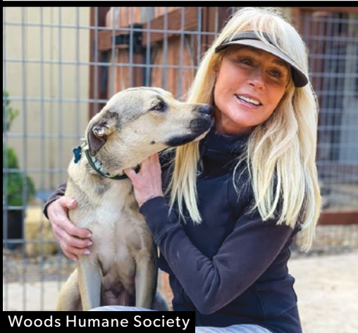
Woods Humane Society