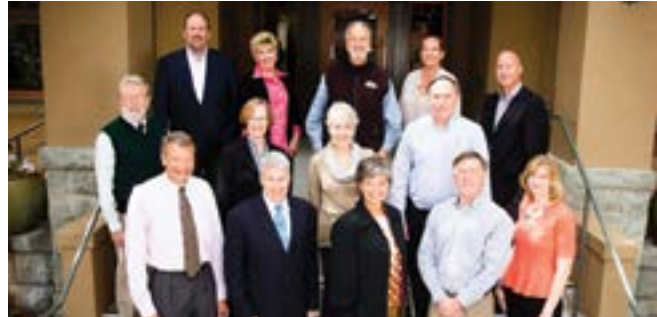
2014 Board of Directors